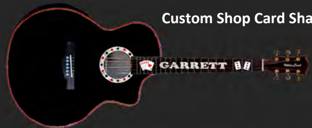
Custom Shop Card Shark