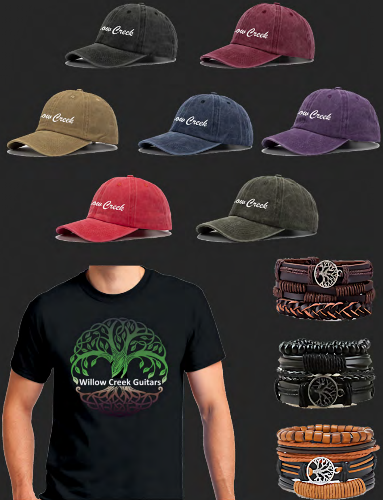
Six panel hats in seven unique colors, T-Shirts in medium, large, extra large and double extra large, and adjustable modular leather wristbands in three different colors.