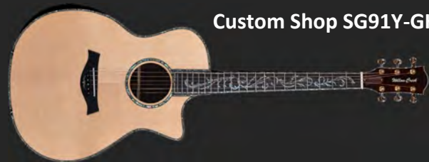
Custom Shop SG91Y-GH